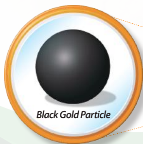
Differentiated Black Gold Conjugate Technology